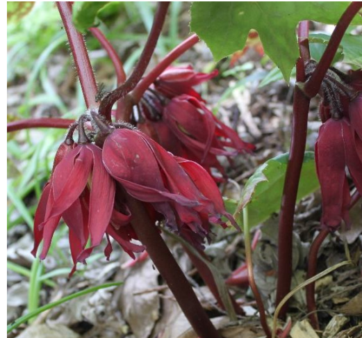
P. delavayi flowers