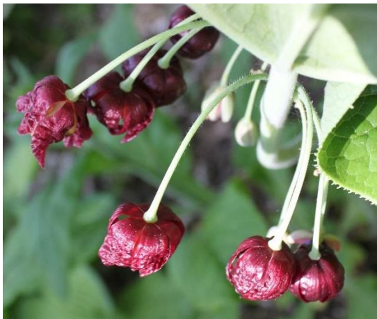
P. pleianthum flowers

Podophyllum pleianthum has large dramatic glossy green leaves with the flowers on the stem beneath the leaves. Podophyllum versipelle is another Asian species with large deeply lobed glossy green leaves and has a variety called 'Spotty Dotty' with reddish brown patterned leaves which has recently become popular and is now available in many good nurseries and even some garden centres.