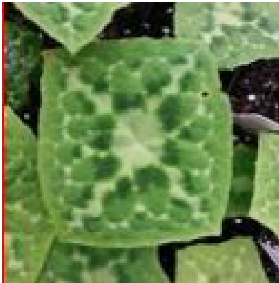
P. deforme leaf

Podophyllum deforme has very unusual angular leaves, which can be square or other shapes with angled corners, green or patterned.