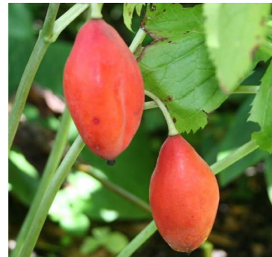
Podophyllum hexandrum flower and fruit

P. delavayi is native to Asia, China and Japan and has the most incredible foliage which emerges in spring like small umbrellas, then opens into a divided star shape of multi-coloured patterns which can vary between plants; the flowers, as in most Asian species are held underneath the leaves hanging down, usually red. The plant has evolved with the flowers in this unusual position to enable them to be symbiotic with ground dwelling beetles to pollinate. The seed pods are apricot coloured.