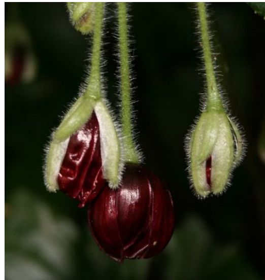
P. deforme flower

Podophyllum pleianthum has large dramatic glossy green leaves with the flowers on the stem beneath the leaves. Podophyllum versipelle is another Asian species with large deeply lobed glossy green leaves and has a variety called 'Spotty Dotty' with reddish brown patterned leaves which has recently become popular and is now available in many good nurseries and even some garden centres.