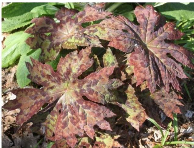
P. delavayi leaf

P. delavayi is native to Asia, China and Japan and has the most incredible foliage which emerges in spring like small umbrellas, then opens into a divided star shape of multi-coloured patterns which can vary between plants; the flowers, as in most Asian species are held underneath the leaves hanging down, usually red. The plant has evolved with the flowers in this unusual position to enable them to be symbiotic with ground dwelling beetles to pollinate. The seed pods are apricot coloured.